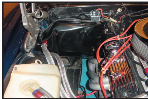
68-79 Nova AC Delete Cover