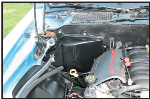
70-81 Camaro AC Delete Cover

There are several different models that will fit most GM classic muscle cars and trucks. As you can see in the pictures above, we have designed this product to resemble the original style non-air firewall cover with plenty of clearance for any motor combination you choose to use.