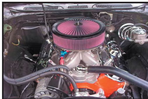
68-72 Chevelle AC Delete Cover