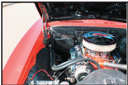
67-69 Camaro AC Delete Cover